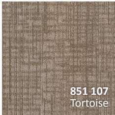
851 107 Tortoise