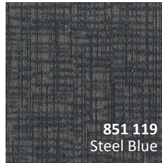
851 119 Steel Blue