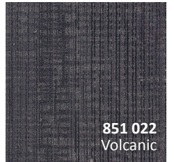
851 022 Volcanic