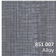
851 007 Alloy