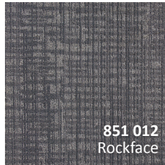
851 012 Rockface