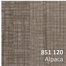
851 120 Alpaca