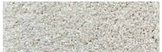
001 Snowy Owl