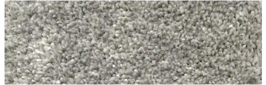
004 Silver Fox