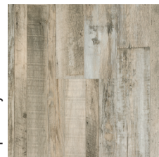
Santa Monica Shores