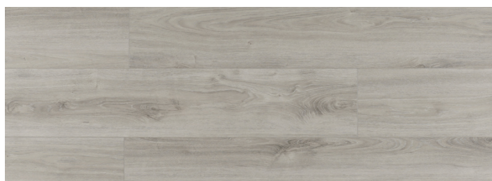
LI-SP04 Daisy Pearl