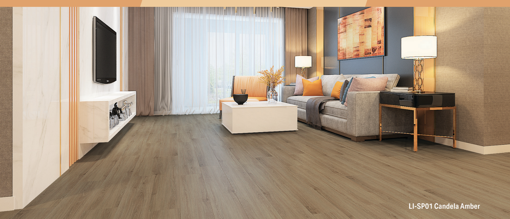
LI-SP01 Candela Amber

The Trenta collection replicates the beauty of natural wood with wood grain embossed decorative film on its surface. Its high-standard 20 mil wear layer provides essential scratch resistance, and its rigid core SPC material offers superior stability and a long-lasting lifespan. The Trenta collection has attached acoustic padding that works as a sound suppressant and is essential for shock absorption. The planks are made from 100% eco-friendly ingredients and are entirely formaldehyde free.