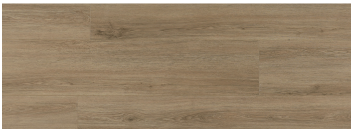
LI-SP01 Candela Amber